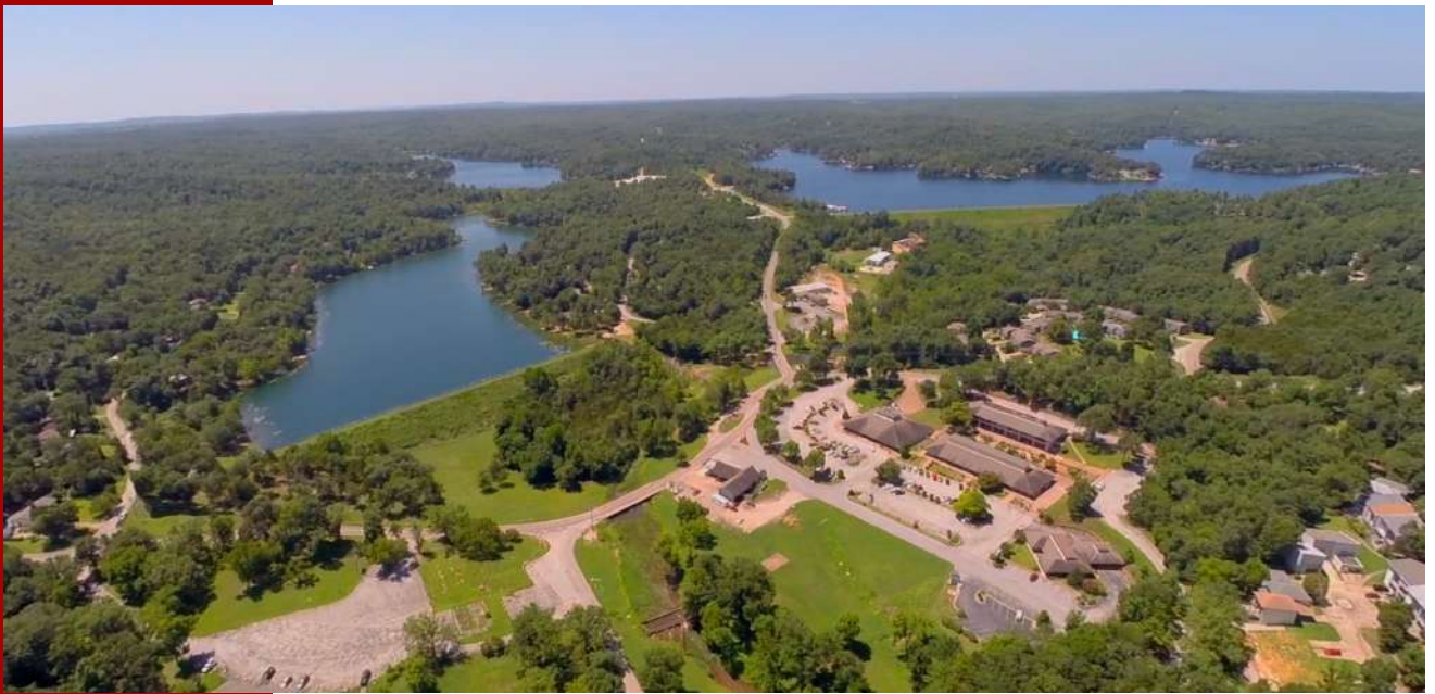
Cherokee Village Town Center